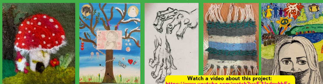
Watch a video about this project: https://www.youtube.com/watch?v=E3JzdrwhbEc

We continue to deliver this weekly session with adults interested in learning about a wide range of artists; art techniques; crafts and BSL. Some recent pictures from the sessions shown here, including a Frida Kahlo project where we all learnt about this fascinating artist and attempted 'Self Portraits' with a difference. This project is funded by Mossley Big Local.