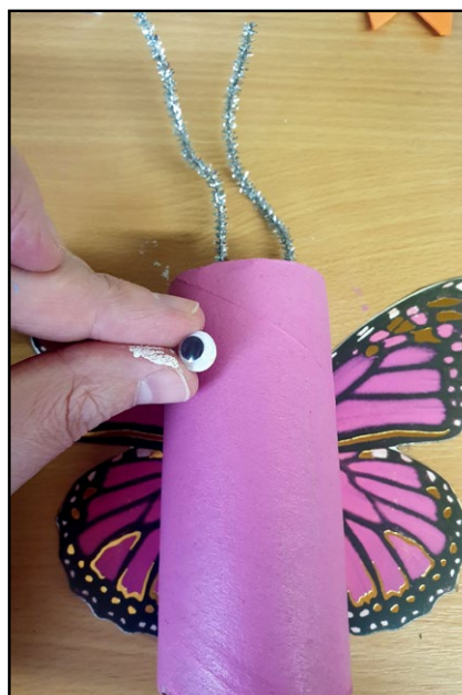
5. Glue the eyes on the front and tape / staple the antennae on