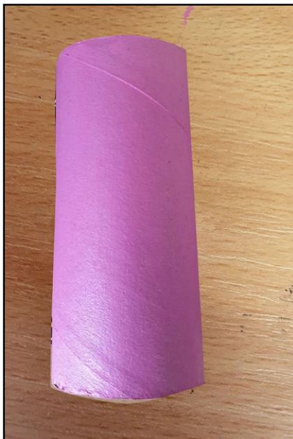
2. Choose a base paint colour