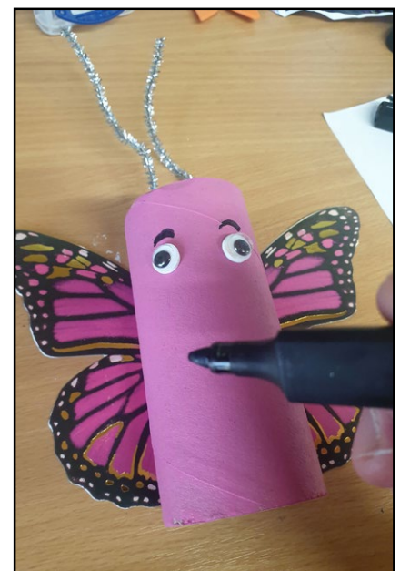
6. Use a black marker to draw a smiley face on your butterfly